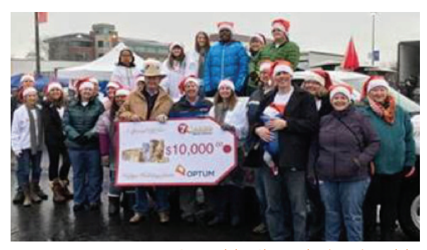
7Cares Idaho Shares day in Boise, Idaho