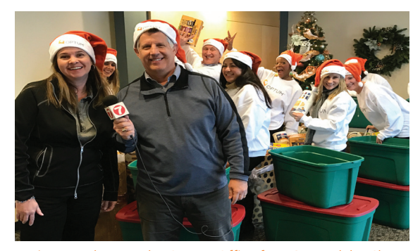
Live Broadcast at the Optum Office for 7Cares Idaho Shares