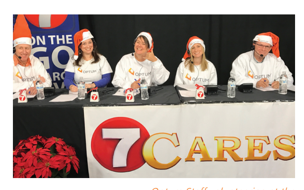
Optum Staff volunteering at the phone bank for 7Cares Idaho Shares